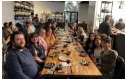
Staff dinner at Lambshed