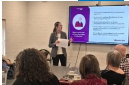
Banking Safely Online sessions delivered to various community groups