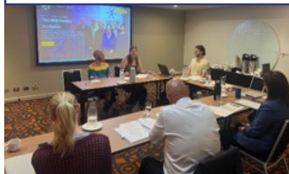
ACT Social Enterprise Grants panel sits