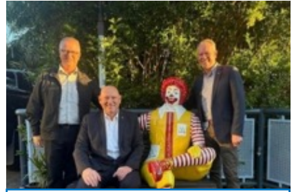
Visit to the Quiet Room at Ronald McDonald House, Newcastle, which we fund