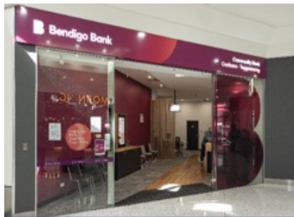
Finalising transition to Bendigo Community Bank

This year's focus was on helping our financial services business to flourish as a Bendigo Community Bank franchisee. We celebrated some important milestones and supported a variety of community initiatives along the way.