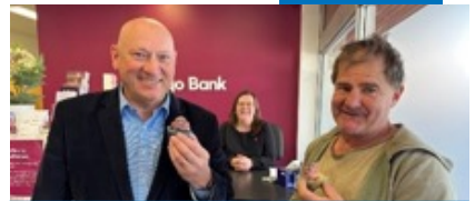
Celebrating 1 year of the Bendigo Community Bank franchise