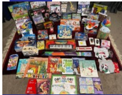
Gifts for Kids collected for Barnardos